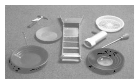
Non-motorized equipment such as pan, pick, shovel, sluice box, and metal detector are permissible for prospecting.