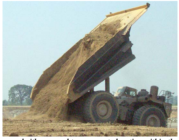
...and either moved to a separate location within the permit area or replaced immediately. Replacing and grading the soil as quickly as possible enhances post-mining productivity.

Operations usually occur in the following manner. Scrapers or other machinery remove the topsoil and subsoil and directly redistribute it on graded overburden or stockpile it for replacement after mining. Seeding and mulching protect the topsoil from wind and water erosion. Stockpiles are marked as being topsoil or subsoil and protected with a cover of vegetation.