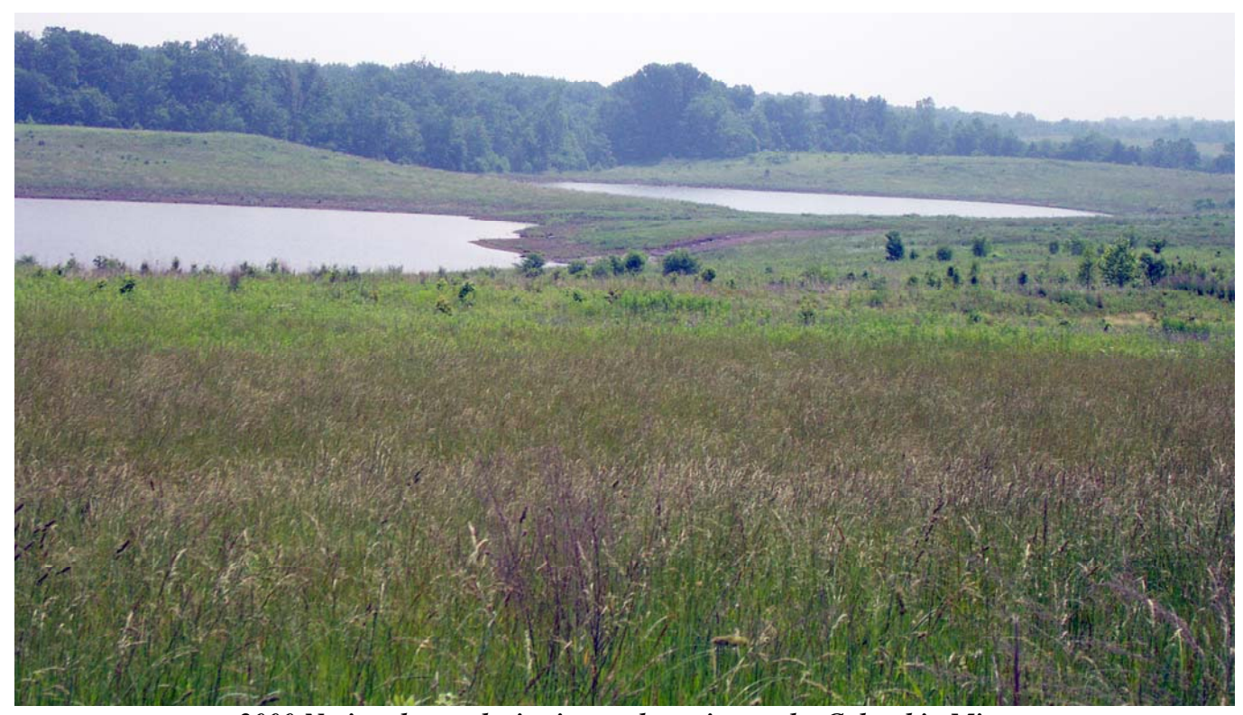
2000 National award winning reclamation at the Columbia Mine