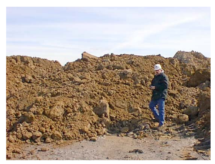
On this site, the coal mine operator has restored more than double the amount required for successful restoration.

Operators must complete the final grading in a timely manner; usually in time for the next growing season. This includes any subsoil or topsoil replacement and installation of erosion control measures such as terraces, diversions, grass waterways and drains.