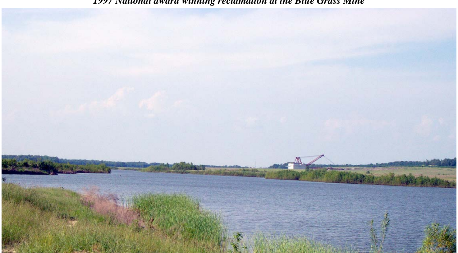
1997 National award winning reclamation at the Blue Grass Mine

Any landowner, coal operator or other potentially adversely affected party may request a review and hearing on the DOR's bond release decision before a Department Administrative Law Judge. If a party continues to disagree, judicial review may be sought.