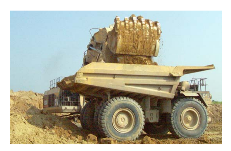
To ensure that adequate soil is available for restoration, soil is collected in advance of the mining operation...

Before mining begins, operators must plan for the replacement of topsoil and subsoil after the coal has been removed. Details involving the removal, storage, replacement, and protection of the topsoil and subsoil from wind and water erosion are listed in the mine operation plan. Topsoil, which is removed in a separate layer from areas to be disturbed, is immediately re-distributed or stored on approved locations.