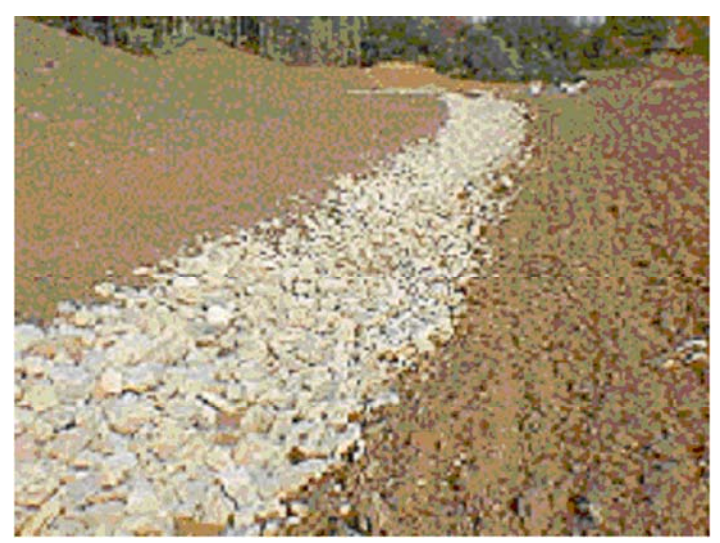
The success of erosion control measures will vary with different sites and must be carefully planned in advance of reclamation.