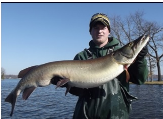
A hefty 48.5" female Muskie collected during annual brood stock collection.