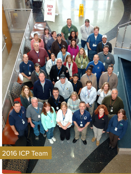
2016 ICP Team