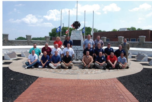
NFA weekend trip attendees pose next to the National Fallen Firefighters Memorial.

Safety, Training Operations for Small Departments, Leadership II, and Fire Behavior in Single Family Dwellings.