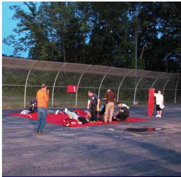
A mass-casualty scenario takes place in District 10. Six 100-patient mass-casualty trailers were purchased by the District 10 EMS Branch.

within district 10, as well as bring public and private providers together to operate more effectively within training or disaster operations.