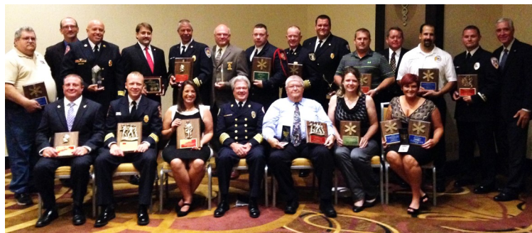
IERC presented its annual awards on August 21. Winners are pictured above.