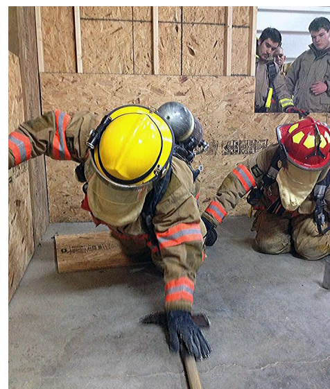
Patoka firefighters practice in their recently dedicated training center, which contains a stair prop and a window for ingress and egress practice.

Over a five-hour period, Wainscott dispatched and helped coordinate more than 100 emergency responders and public works staff, including out-of-state resources, to rescue a man pinned 12 feet down in a collapsed trench. Wainscott worked that shift