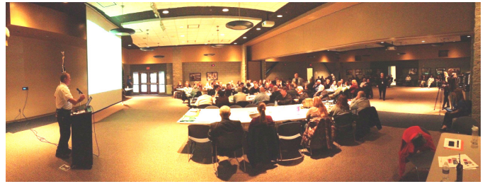
The Evansville/Vanderburgh County Emergency Management Agency hosted an infectious disease tabletop involving responders and emergency management officials from all District 10 counties and some from Kentucky.

The presentation consisted of what Ebola