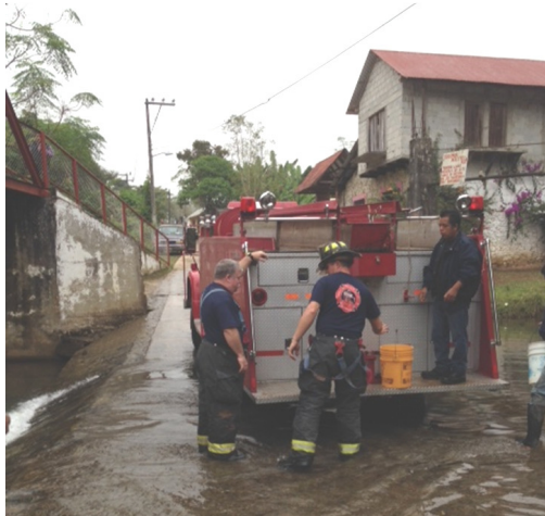
Firefighters in Calnali, Mexico, fill the Darlington, IN fire truck from a wet bridge.