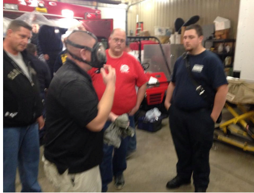
Delaware County EMS and EMA personnel review tactics and procedures for potentially infectious patients.

“IEMS is using (a software) platform to visually display trends of influenza-like symptoms. The dashboard system allows us to quickly view a change in what is considered a normal pattern. Any spike